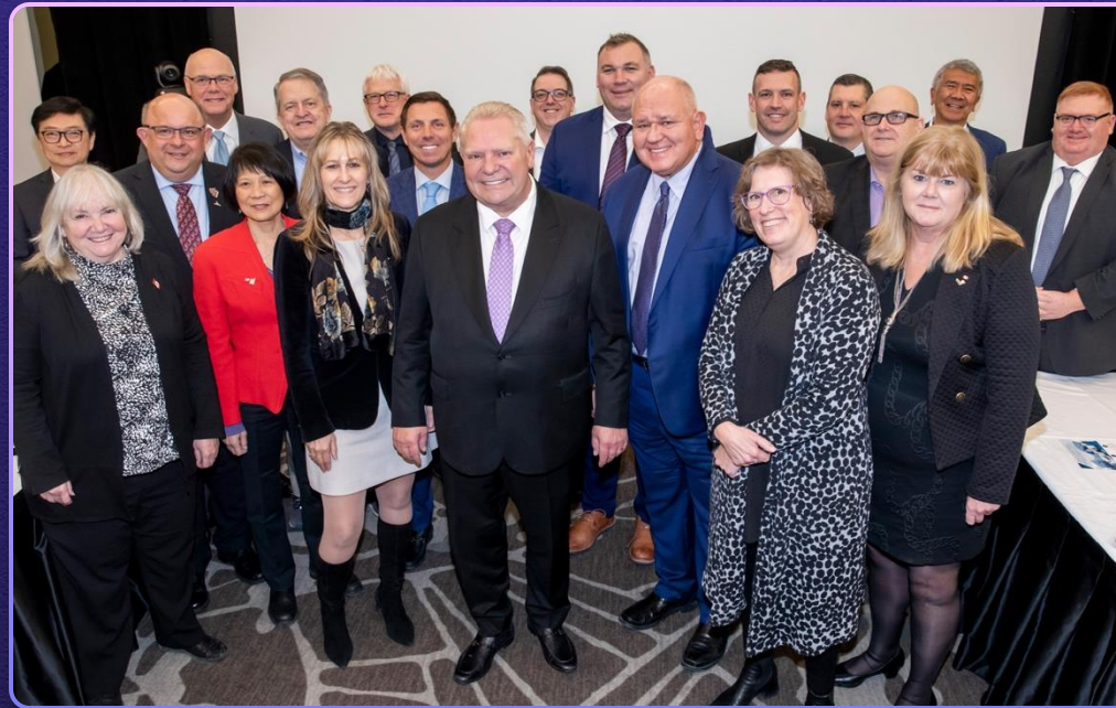
Ontario's Big City Mayors Caucus (OBCM)

Minister of Housing and Infrastructure of Canada