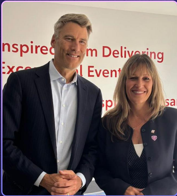
The Honourable Gregor Robertson

Minister of Housing and Infrastructure of Canada