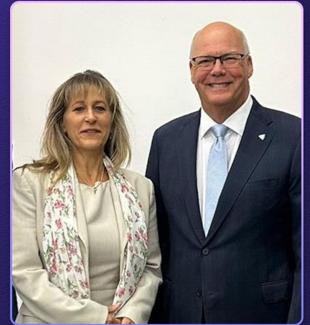
The Honourable Rob Flack

Minister of Municipal Affairs and Housing of Ontario